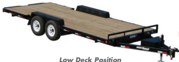
Low Deck Position