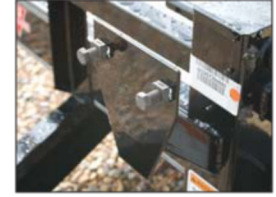
Spare Tire Mount