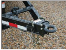
3" Pintle Eye