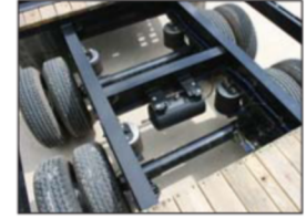
TRAILER FLEX TrailerFlex Air Ride Suspension