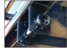
Sliding Strap Ratchets