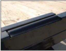
Winch Cable Roller