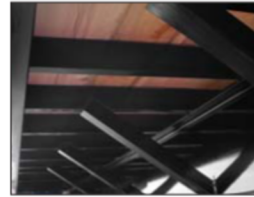
12" oc Crossmembers