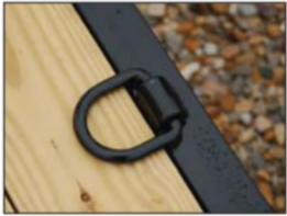
1 Pair D-Rings