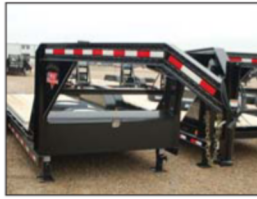
8" I-Beam Gooseneck