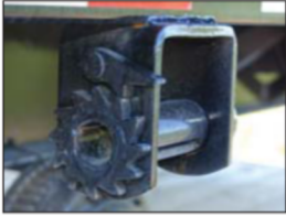
Weld On Strap Ratchets (2)