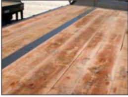
Rough Oak Floor