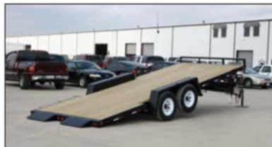
Deck Tilted in Low Position

The patented MultiDeck Tilt by PJ Trailers is one of the most versatile trailers ever built. The trailer can be operated in a low equipment hauler position with a 26" deck height or a high position with a 35" deck height and 102" wide deck. This makes the trailer extremely useful for hauling both narrow or wide track equipment like skid steer and tractors, as well as palletized cargo.