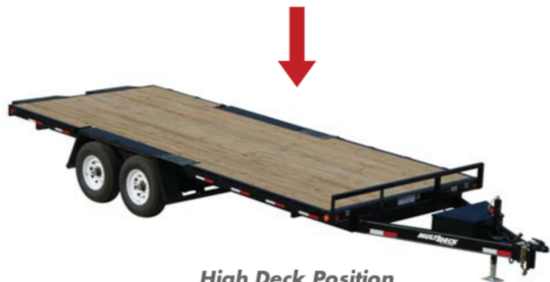
High Deck Position