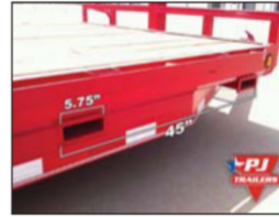
Pallet Fork Holders (T6 & TF)