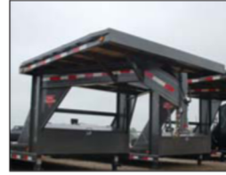
Deck on the Neck (GN Only)