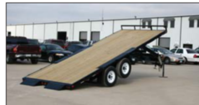
Deck Tilted in High Position