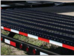
1x1 Angle Traction Bars on Rear of Deck (T8, T9, & TD)