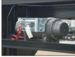
Winch 12VDC (12,000 lb.)