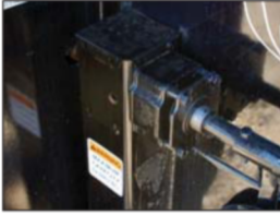
2 Speed Jacks