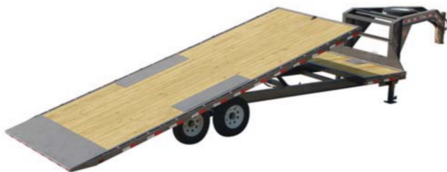
26 ft Grey Gooseneck Deckover Tilt (22' Tilt + 4' Stationary Deck)