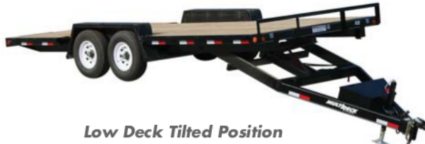
Low Deck Tilted Position