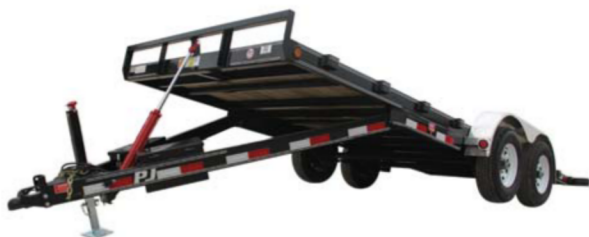
20 ft 83" Hydraulic Quick Tilt Front View

† Weights are estimated for base trailer only, PJ Trailers makes no guarantee regarding the accuracy of estimated weights