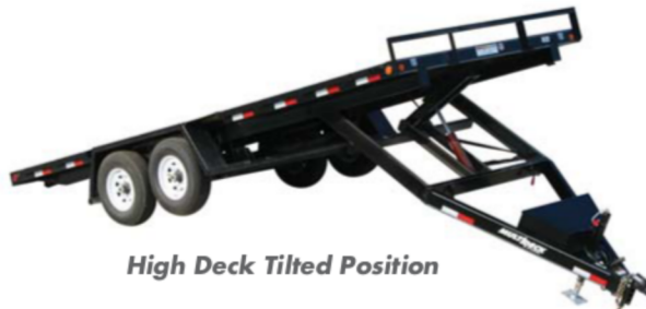
High Deck Tilted Position