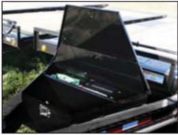
Full Size Divided Toolbox Upgrade (T8 & T9)