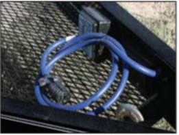
Cold Weather Wiring Harness (7-Way RV)