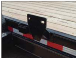
Carhauler Spare Tire Mount