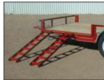
Side Mount ATV Ramps