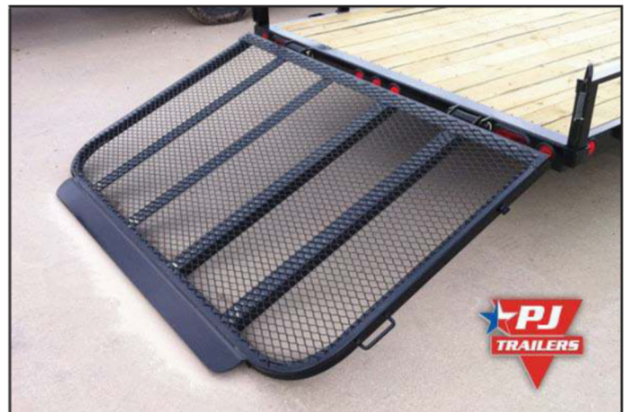
Ramp Gate Transition Lip