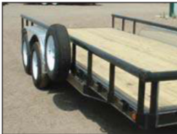
2" Pipetop Removeable Siderails