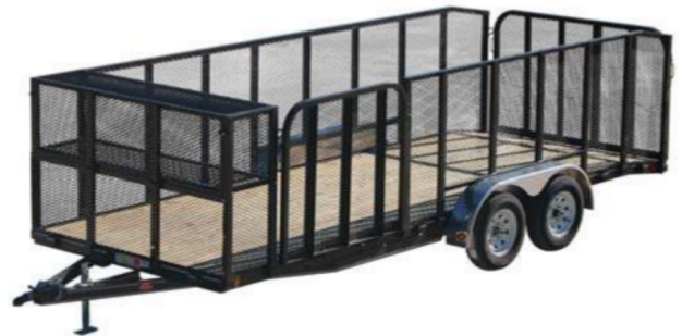
4 ft Landscape Trailer Expanded Metal Sides with Landscape Box & Side Gate