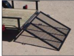
3' Fold-up Gate (U1)