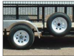
Utility Spare Tire Mount