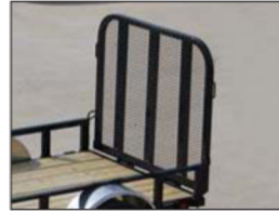
4' Fold-up Gate (U6, U7, U8)