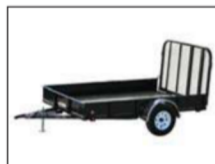
Regular Sides w/ Solid Metal