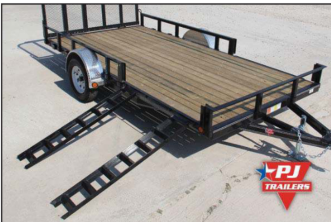
ATV Side Ramps