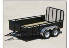
22" Solid Metal Sides w/ 2" Pipe-top Rail