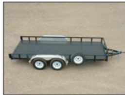
Steel Floor w/ 4 D-Rings