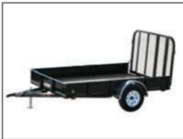
Regular Sides w/ Solid Metal