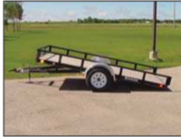
Tilt Deck (U6, U7, & U8)