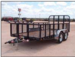
2 ft Expanded Metal Sides