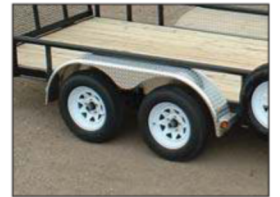
Diamond Plate Fenders