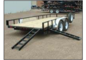
5' Slide-in Ramps (U6, U7, U8)