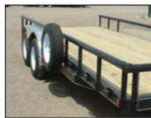
2" Pipetop Removeable Siderails