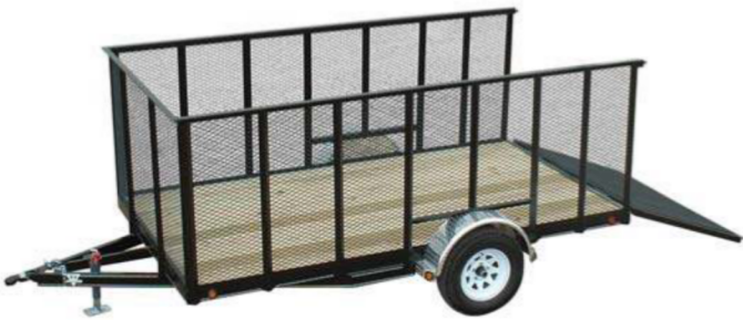
4 ft Landscape Trailer Expanded Metal Sides