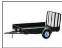
Regular Sides w/ Solid Metal