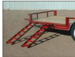
Side Mount ATV Ramps