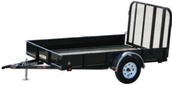
Regular Sides with Solid Metal