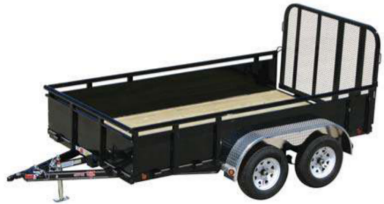
22" Solid Metal Sides with 2" Pipe-top Rail