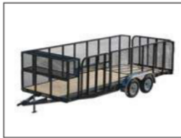
4 ft Expanded Metal Sides