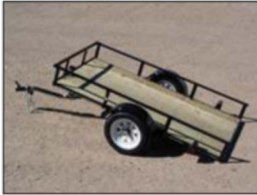
Tilt Deck (U1)