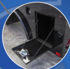
Side Rear Tool Boxes (Optional)