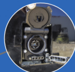
4/5 & 7 Way Plug