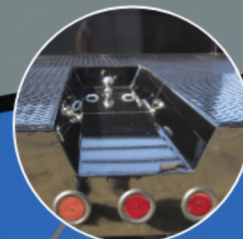
Gooseneck Trough (Optional)