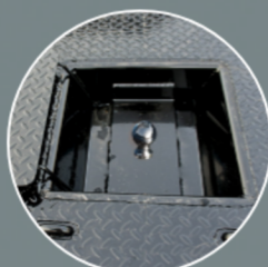
Gooseneck Ball Mount