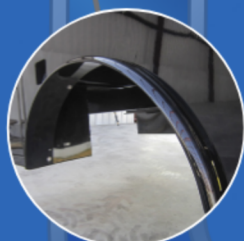
Smooth Plate Fenders