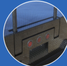
Recessed Spike Arm