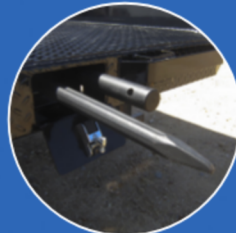
Side Compartment For Spikes