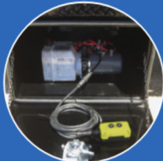
Double Acting Power Unit