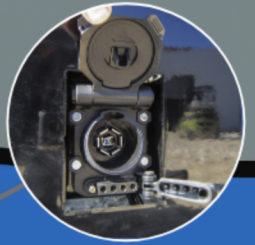
4/5 & 7 Way Plug