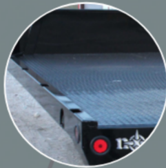
Internal Stake Pockets