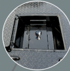
Gooseneck Ball Mount